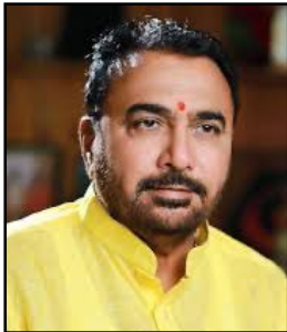
Shri Prataprao Jadhav

The Institute is fully funded by Ministry of Ayush, Govt. of India. The authorities and the officers of the Institute are - The President, The General Body, The Governing Council, The Director and such other committees, sub- committees, authorities and officers as may be appointed by the Governing Council, e.g. Standing Finance Committee, Scientific Advisory Committee, Academic Committee etc.